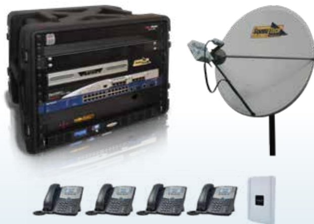
Squire Tech Solutions BC600 equipment shown above.

Squire Tech Solutions' Business Continuity (BC) Equipment Packages and Service Plans offer low satellite latency, high quality audio and video for live business applications. Our small antennas fit easily on any building, ground mounted pole or Company Office Trailer. Resilient VSAT hardware operation free up valuable time to focus on other vital response tasks. Bandwidth can be available in days rather than months or weeks. User friendly satellite communications operates just like DSL, Cable, or any other IP Network. No special skills are required. BC systems are ideal for any critical operation. Field teams and business operations staff need to communicate to perform their function. They cannot without relying on phone lines, Data, Internet, or other critical resources. Squire Tech Solutions' Business Continuity Communications integrates with your communication systems to ensure connectivity where and when you need it.